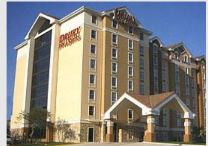
Drury Inns and Suites 9806 I. H. 10 West San Antonio, TX 78240

The NACFM National Conference will be hosted by Oak Hill Church. We will start Sunday, June 15 th and will close at the conclusion of the banquet on Thursday night, June 19 th . The schedules of events are as follows: